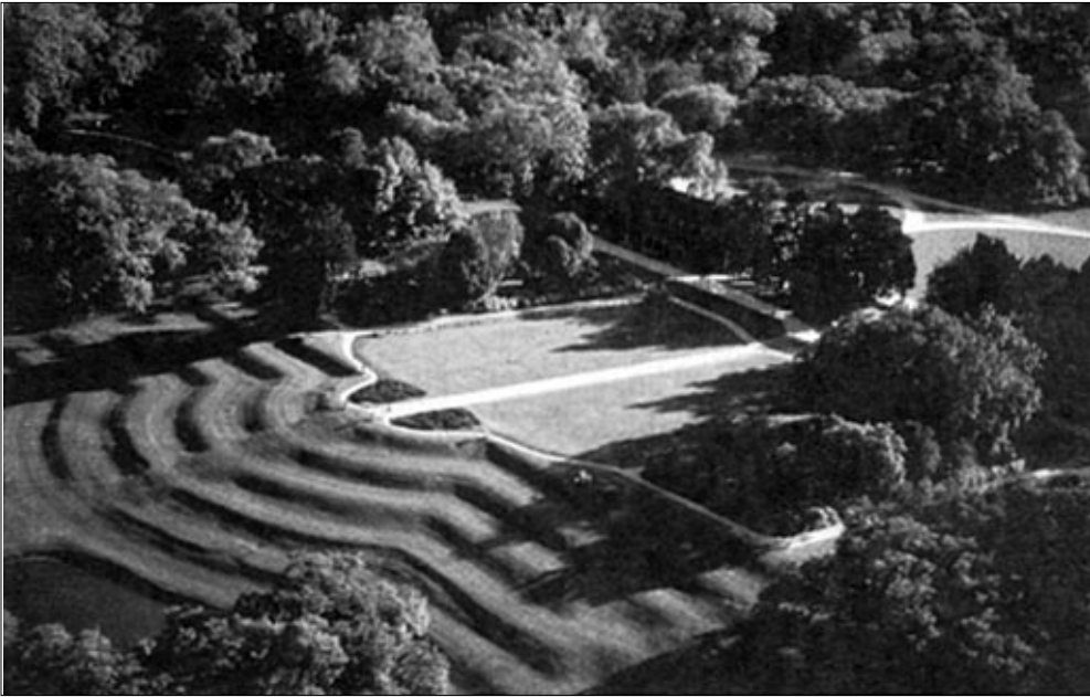
The spacious grounds at Middleton Place, near Charleston, South Carolina, constitute the first landscaped garden in America. The molded terraces, originally constructed in the 18th century, were largely reconstructed in the early 20th century based on extant remains and other documentary evidence.