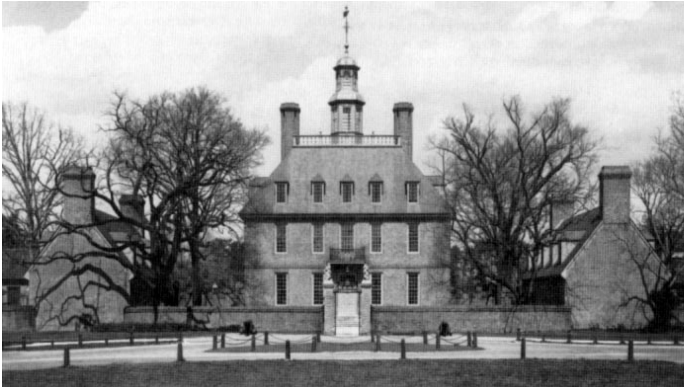
In the 1930s reconstruction of the 18th century Governor's Palace at Colonial Williamsburg, Virginia, the archeological remains of the brick foundation were carefully preserved in situ, and serve as a base for the reconstructed walls.

it did at a particular—and most significant—time in its history. The difference is, in Reconstruction , there is far less extant historic material prior to treatment and, in some cases, nothing visible. Because of the potential for historical error in the absence of sound physical evidence, this treatment can be justified only rarely and, thus, is the least frequently undertaken. Documentation requirements prior to and following work are very stringent. Measures should be taken to preserve extant historic surface and subsurface material. Finally, the reconstructed building must be clearly identified as a contemporary re-creation.