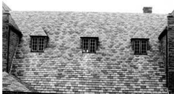
This graduated slate roof is composed of large, thick slates at the eave which are reduced in size and thickness as the slating progresses to the ridge.

The configuration, massing, and style of historic slate roofs are important design elements that should be preserved. In addition, several types of historic detailing were often employed to add visual interest to the roof essentially elevating the roof to the level of an ornamental architectural element. When repairing or replacing a slate roof, original details affecting its visual character should be retained.