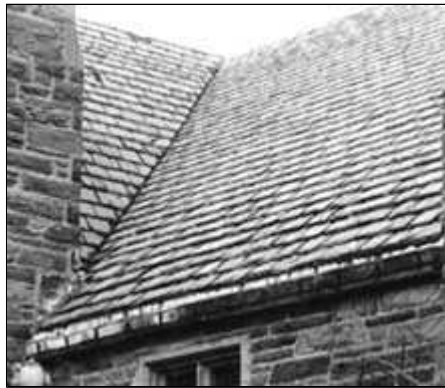
Valleys are formed at the internal angle of two roofing slopes. Flashing is often placed under the slate to increase moisture protection at this vulnerable joint.

Graduated slate roofs were frequently installed on large institutional and ecclesiastical structures. The slates were graduated according to thickness, size, and exposure, the thickest and largest slates being laid at the eaves and the thinnest and smallest at the ridge. Pleasing architectural effects were achieved by blending sizes and colors.