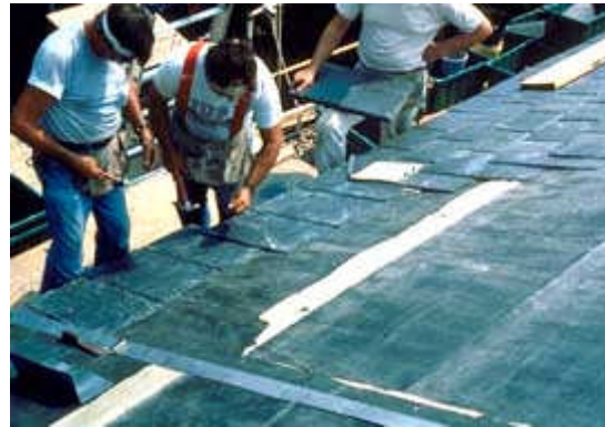
Roofing felt is being installed over the decking; a rubberized membrane is used selectively at the eaves and under some flashing.

Clear roof expanses can be covered by an experienced slater and one helper at the rate of about two to three squares per day. More complex roofs and the presence of chimneys, dormers, and valleys can bring this rate down to below one square per day. One square per day is a good average rate to use in figuring how long a job will take to complete. This takes into account the installation of flashings and gutters and the setup and breakdown of scaffolding. Tear-off of the existing roof will require additional time.