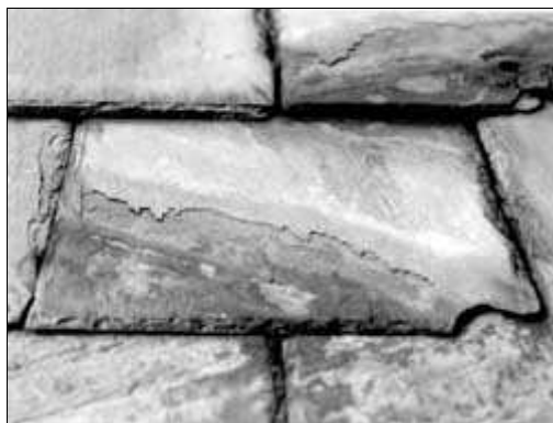
Paper thin lamination can be seen flaking off this weathered, 120 year piece of Pennsylvania Hard-Vein slate.

The weathering of slate is chiefly due to mineral impurities (primarily calcite and iron sulfides) in the slate which, in concert with alternating wet/dry and hot/cold cycles, react to form gypsum. Because gypsum molecules take up about twice as much volume as calcite molecules, internal stresses result from the reaction, causing the slate to delaminate. This type of deterioration is as prominent on the underside of the roof as on the exposed surface due to the leaching and subsequent concentration of gypsum in this area. Consequently, deteriorated roofing slates typically cannot be flipped over and reused.