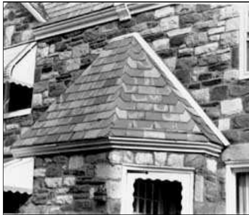
The white blotches on these Pennsylvania Soft-Vein slates indicate areas where gypsum is leaching out onto the surfaces of the slates.

The durability of a slate roof depends primarily on four factors: the physical and mineralogical properties of the slate; the way in which it is fabricated; installation techniques employed; and, regular and timely maintenance. The first three of these factors are examined below. The maintenance and repair of slate roofs are discussed in later sections of this Brief.