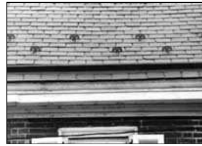
Eave details include snow guards, snow boards, and gutter treatments. Snow guards are generally used in areas where the ice and snow accumulate to avoid dangerous slides from the roof.

Beginning in the late nineteenth century, asphalt saturated roofing felt was installed atop solid wood sheathing. The felt provided a temporary, watertight roof until the slate could be installed atop it. Felt also served to cushion the slates, exclude wind driven rain and dust, and ease slight unevenness between the sheathing boards.