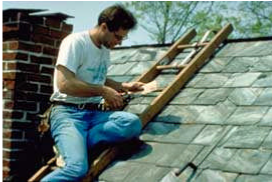
After removing the deteriorated slate and sliding the new slate into place, it is secured with a copper nail. A copper bib (shown here) is formed to protect the newly created nail hole. Finally, a slate hammer is used to push the bib in place over the nail head.

hammer can be punched into the slate and the slate dragged out. A new slate, or salvaged slate, which should match the size, shape, texture, and weathered color of the old slate, is then slid into place and held in position by one nail inserted through the vertical joint between the slates in the course above and approximately one inch below the tail of the slate two courses above.