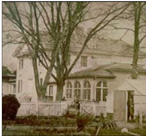
Prior to a replacing a roof, historical documentation is gathered (such as photo documentation) to determine the roof configuration.

undertaken and financial resources set aside, thereby, reducing the likelihood of rash last minute decisions.