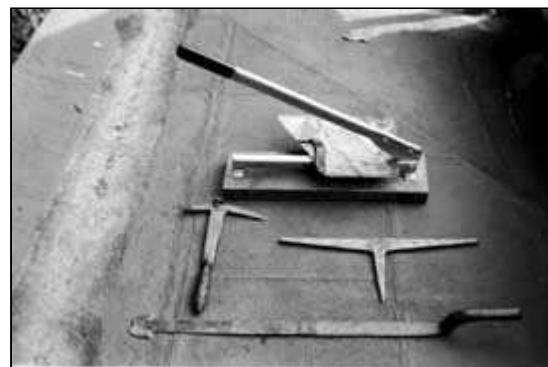
These traditional slater's tools are used to cut and trim, hammer, measure, and rip out nails.

Slate roofing tiles are still manufactured by hand using traditional methods in a five step process: cutting, sculping, splitting, trimming, and hole punching . In the manufacturing process, large, irregular blocks taken from the quarry are first cut with a saw across the grain in sections slightly longer than the length of the finished roofing slate. The blocks are next sculped, or split along the grain of the slate, to widths slightly larger than the widths of finished slates. Sculping is generally accomplished with a mallet and a broadfaced chisel, although some types of slate must be cut along their grain. In the splitting area, the slightly oversized blocks are split along their cleavage planes to the desired shingle thickness. The splitter's tools consist of a wooden mallet and two splitting chisels used for prying the block into halves and repeating this process until the desired thinness is reached. The last two steps involve trimming the tile to the desired size and then punching two nail holes toward the top of the slate using a formula based on the size and exposure of the slate.