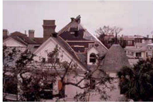
After a hurricane or other natural disaster, it may be necessary to stabilize a roof temporarily until materials can be obtained and a qualified roofing contractor hired. Significant slate roofs should not be stripped off and replaced with asphalt shingles.

process to begin. Heavy gauge plastic and vinyl tarpaulins are often used for this purpose, though they are difficult to secure in place and can be blown off in high winds. Roll roofing, carefully stitched in to areas of the remaining roof, is a somewhat more functional solution that will allow sufficient time to document the existing roof conditions, plan repairs, and order materials.