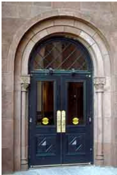
The automatic door to this museum building is a practical solution for universal entry.

Today, few building owners are exempt from providing accessibility for people with disabilities. Before making any accessibility modification, it is imperative to determine which laws and codes are applicable. In addition to local and State accessibility codes, the following federal accessibility laws are currently in effect: