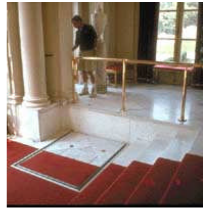
A retractable lift for this historic building foyer was created using "like" materials.

Installing Ramps and Wheelchair Lifts. If space permits, ramps and wheelchair lifts can also be used to increase accessibility inside buildings. However, some States and localities restrict interior uses of wheelchair lifts for life-safety reasons. Care should be taken to install these new features where they can be readily accessed. Ramps and wheelchair lifts are described below.