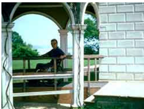
The significant building site is now accessible to people with disabilities (note steps in front of ramp).

An accessible route from a parking lot, sidewalk, and public street to the entrance of a historic building or facility is essential. An accessible route, to the maximum extent possible, should be the circulation route used by the general public. Critical elements of accessible routes are their widths, slopes, cross slopes, and surface texture. Each of these route elements must be appropriately designed so that the route can be used by everyone, including people with disabilities. The distance between the arrival and