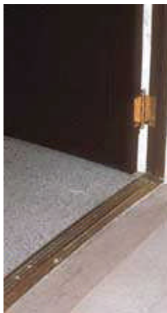
The historic threshold was made accessible with a 1/2" wood bevel.

Whenever possible, access to historic buildings should be through a primary public entrance. In historic buildings, if this cannot be achieved without permanent damage to character-defining features, at least one entrance used by the public should be made accessible. If the accessible entrance is not the primary public entrance, directional signs should direct visitors to the accessible entrance. A rear or service entrance should be avoided as the only mean of entering a building.