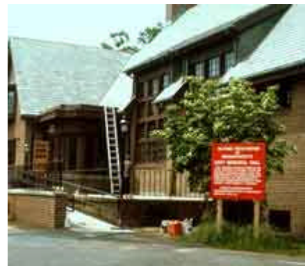
This accessibility ramp is compatible with the historic building in scale and materials.

If the property has been designated as historic (properties that are listed in, or eligible for listing in the National Register of Historic Places, or designated under State or local law), the property's nomination file should be reviewed to learn about its significance. Local preservation commissions and State Historic Preservation Offices can usually provide copies of the nomination file and are also resources for additional information and assistance. Review of the written documentation should always be supplemented with a physical investigation to identify which character defining features and spaces must be protected whenever any changes are anticipated. If the level of documentation for a property's significance is limited, it may be necessary to have a preservation professional identify specific historic features, materials, and spaces that should be protected.