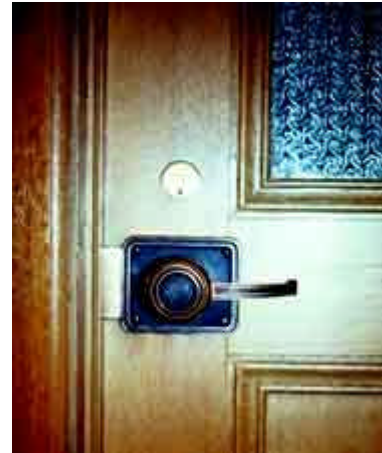
This door handle has been retrofitted to meet ADA requirements.

Altering Door Thresholds. A door threshold that exceeds the allowable height, generally ½" (1.3 cm), can be altered or removed with one that meets applicable accessibility requirements. If the threshold is deemed to be significant, a bevel can be added on each side to reduce its height. Another solution is to replace the threshold with one that meets applicable accessibility requirements and is visually compatible with the historic entrance.