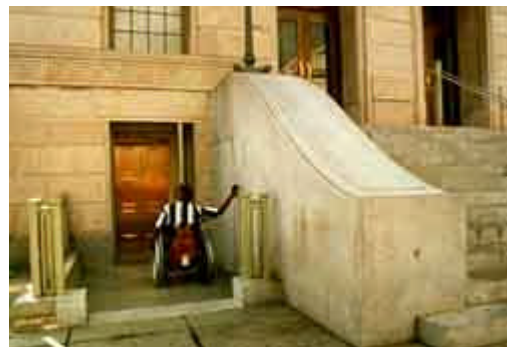
A new elevator entrance was provided next to the stairs to provide universal access to the services inside.

The steepest allowable slope for a ramp is usually 1:12 (8%), but gentler slopes should be used whenever possible to accommodate people with limited strength. Greater changes in elevation require larger and longer ramps to meet accessibility scoping provisions and may require an intermediate landing. Most codes allow a slightly steeper ramp for historic buildings to overcome one step.