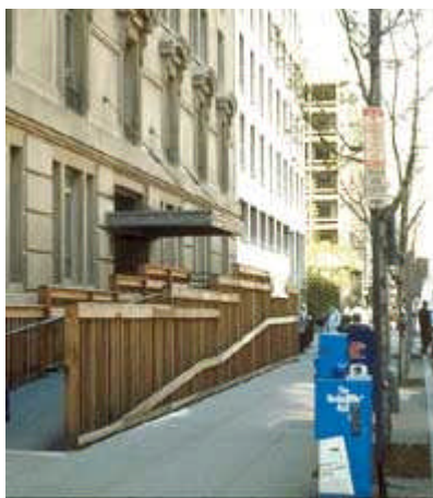
The ramp's scale and materials are inconsistent with the historic character of the building.

All proposed changes should be evaluated for conformance with the Secretary of the Interior's "Standards for the Treatment of Historic Properties," which were created for property owners to guide preservation work. These Standards stress the importance of retaining and protecting the materials and features that convey a property's historical significance. Thus, when new features are incorporated for accessibility, historic materials and features should be retained whenever possible. Accessibility modifications should be in scale with the historic property, visually compatible, and, whenever possible, reversible. Reversible means that if the new feature were removed at a later date, the essential form and integrity of the property would be unimpaired. The design of new features should also be differentiated from the design of the historic property so that the evolution of the property is evident.