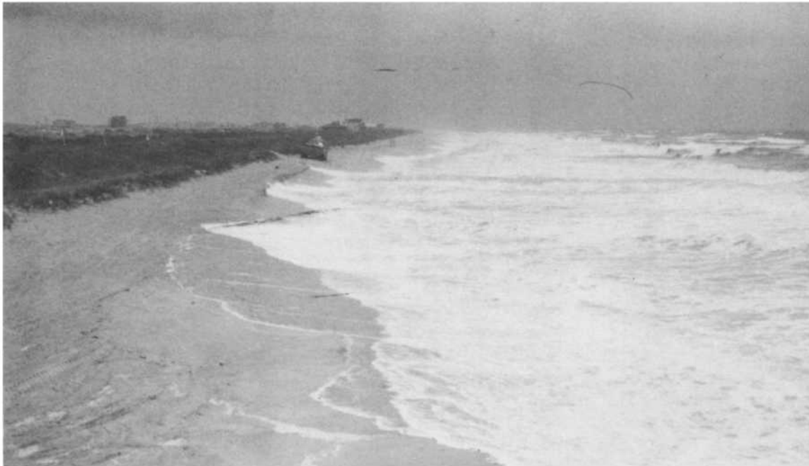
Figure 4-9. Dissipative surf conditions during Storm, Outer Banks, North Carolina

(b) Considering that the objective of most dune stabilization projects is to reduce the frequency of overwash and flooding, barrier island migration is an issue that should be addressed on a case-by-case basis. Though overwash processes have been shown to dominate some narrow barrier islands, most barrier islands appear to be too wide to migrate as a result of overwash. For example, the North Carolina barrier islands have narrowed, not migrated, over the past 130 years (Everts et al. 1983). Beach sands carried by overwash rarely reach the lagoonal side of most barrier islands, though after the barrier island narrows to a critical width, overwash events may contribute to landward migration. Leatherman (1976) determined the critical maximum width for overwash based on an effective transport mechanism on Assateague Island, Maryland, to be between 100 and 200 meters (300 to 600 feet).