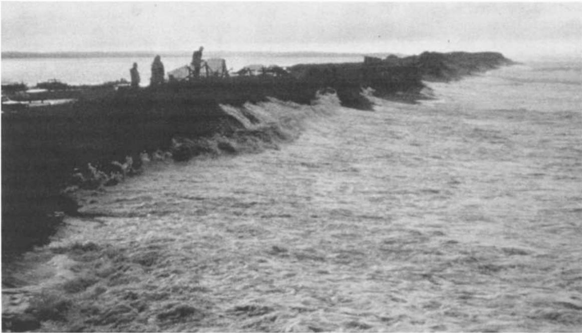
Figure 4-7. Dunes under wave attack, Cape Cod, Massachusetts