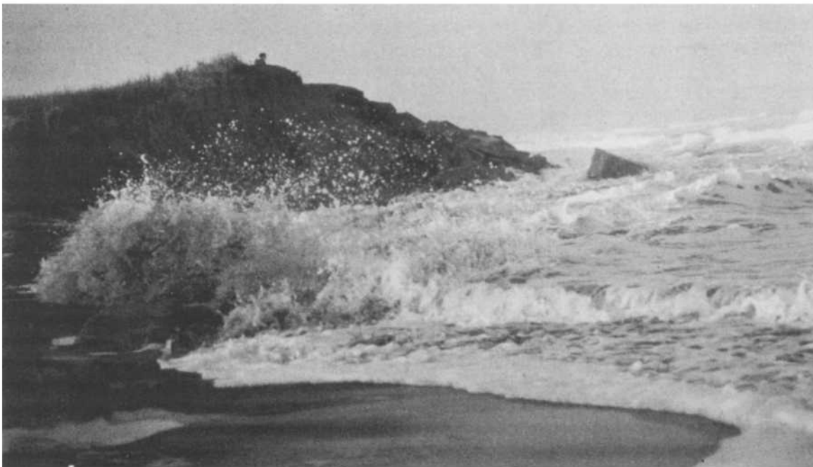
Figure 4-8. Dunes erosion during severe storm, Cape Cod, Massachusetts