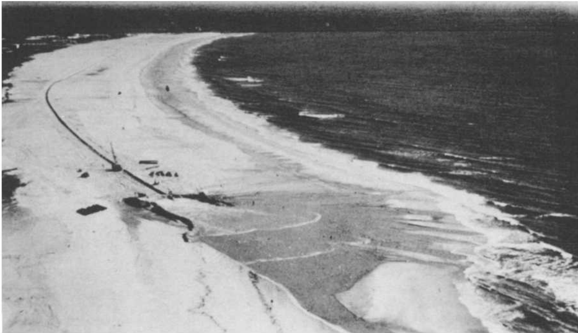
Figure 4-2. Beach nourishment operation, Mayport, Florida

(1) As a wave moves toward shore, it encounters the first beach defense in the form of the sloping nearshore bottom (Figure 4-3; Profile A). Along a gently sloping beach, when the wave reaches a water depth equal to about 1.3 times the wave height, the wave collapses or breaks. Thus, a wave 0.9 meter (3 feet) high will break in a depth of about 1.2 meters (4 feet). If there is an increase in the incoming wave energy, the beach adjusts its profile to facilitate the dissipation of the additional energy. This adjustment is most frequently done by the seaward transport of beach material to an area where the bottom water velocities are sufficiently reduced to cause sediment deposition. Eventually enough material is deposited to form an offshore bar that causes the waves to break farther seaward, widening the surf zone over which the remaining energy must be dissipated. Tides compound the dynamic beach response by constantly changing the elevation at which the water intersects the shore and by providing tidal currents. Thus, the beach is always adjusting to changes in both wave energy and water level.