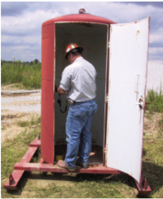
Figure 3. Blasting shelter at a surface limestone mine in Ohio.

Light buildings, pickup trucks, and other vehicles which are often used as covers, have been penetrated by flyrock [Schneider, 1996]. During a coal mine blast, a blaster positioned himself under a Ford 9000, 21/2-ton truck, and fired the shot. A piece of flyrock traveled about 750 ft and fatally injured the blaster under the truck [MSHA, 1992]. This accident could have been prevented by using an adequate blasting shelter. A safe location and sufficient cover is critical to a blaster's protection if the firing lines are not long enough to be beyond the flyrock range [Schneider, 1996]. Some blasting operations use a remote controlled firing system to permit blasters to stay out of the blast area.