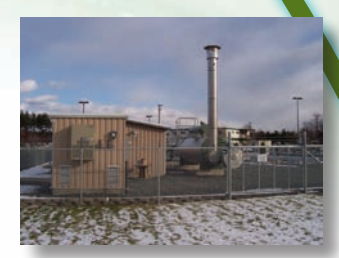
Metering and Regulating Station

See http://www.phmsa.dot.gov for additional pipeline-related terminology definitions.