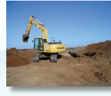
Pressure testing for leaks