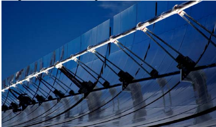
Figure 4. Parabolic trough linear concentrator mirrors

Dish/engine technology uses a large parabolic dish of mirrors coupled with fluid-containing receiving tubes and an engine to generate mechanical power (rather than steam) for electricity production. ( Figure 6 ). Dish/engine systems generally have an electricity production capability ranging 3-25 kilowatts, which is substantially lower than the other two CSP technologies. Because dish/engine systems are modular with relatively low production capacities for individual units, they may be better suited for smaller-scale operations (DOE, 2008b). Similar to linear concentrators and power towers, dish/engine systems will also require flat grades to provide adequate support.