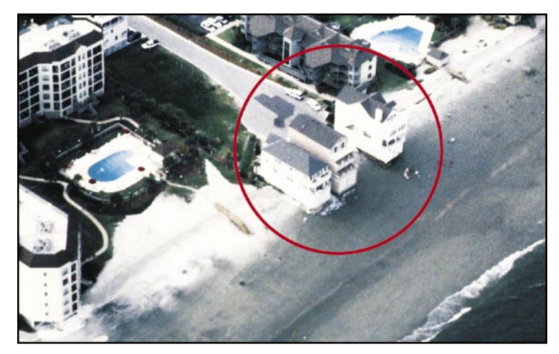
Figure 1. Well-built but poorly sited building.

A well-built but poorly sited building can be undermined and will not be a success (see Figure 1). Even if a building is set back or situated farther from the coastline, it will not perform well (i.e., will not be a success) if it is incapable of resisting high winds and other hazards that occur at the site (see Figure 2).