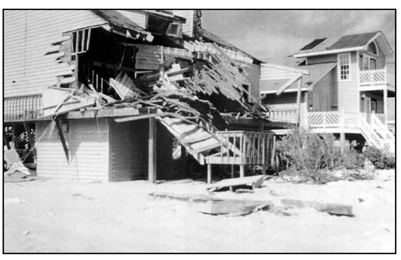
Figure 2. Well-sited building that still sustained damage.