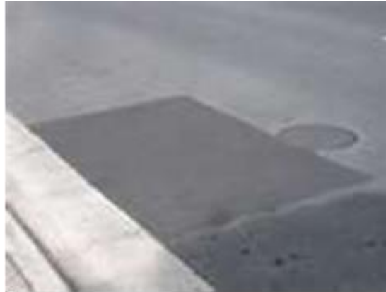
Special Pavement Patching