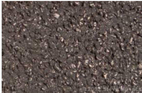
(Steve Muench; hawaiiiasphalt.org)

Open-graded friction courses (OGFC) have been used across the U.S. since the 1950's to improve the surface frictional resistance of asphalt pavements. In 1974, the Federal Highway Administration (FHWA) developed an OGFC mix design procedure to be used by state departments of transportation (DOTs). At first, many DOTs reported good performance using OGFC but others stopped using these mixes due to unacceptable performance. Since then, many significant improvements have been made in the areas of OGFC gradation and binder type.