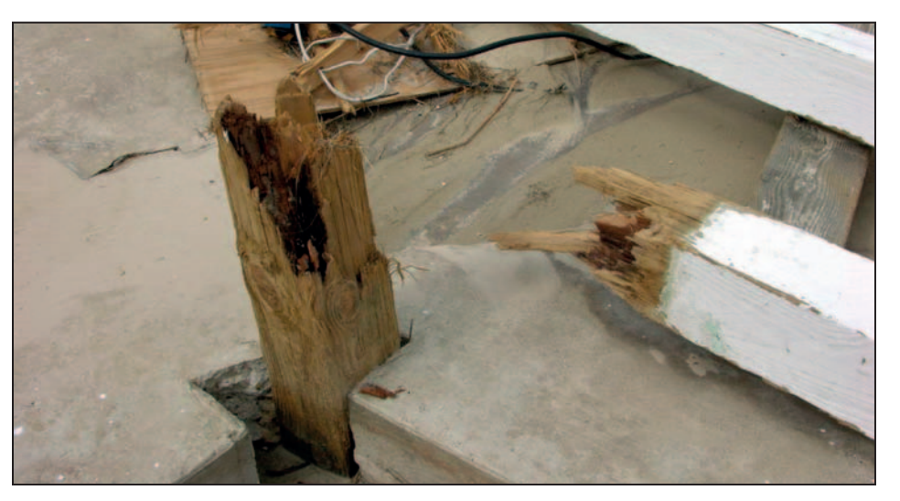
Figure 14-1. Pile that appears acceptable from the exterior but has interior decay

or resources that augment the guidance and other information in this Manual, see the Residential Coastal Construction Web site (http:// www.fema.gov/rebuild/mat/ fema55.shtm).