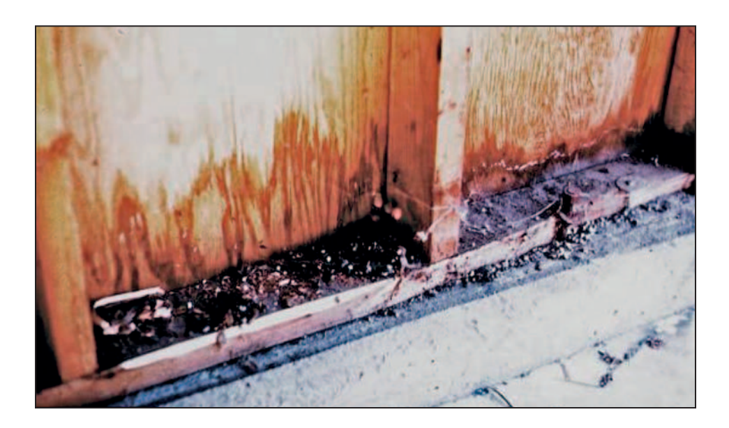
Figure 14-4. Deteriorated wood sill plate

Shearwall sill plates bearing directly on continuous footings or concrete slabs-on-grade, if used in coastal construction, are particularly susceptible to decay in moist conditions. Figure 14-4 shows a deteriorated sill plate. Even if the decay of the preservative-treated sill plate is retarded, the attached untreated plywood can easily decay and the shearwall will lose strength. Conditions that promote sill and plywood decay include an outside soil grade above the sill, stucco without a weep screed at the sill plate, and sources of excessive interior water vapor. Correcting these conditions helps maintain the strength of the shearwalls.