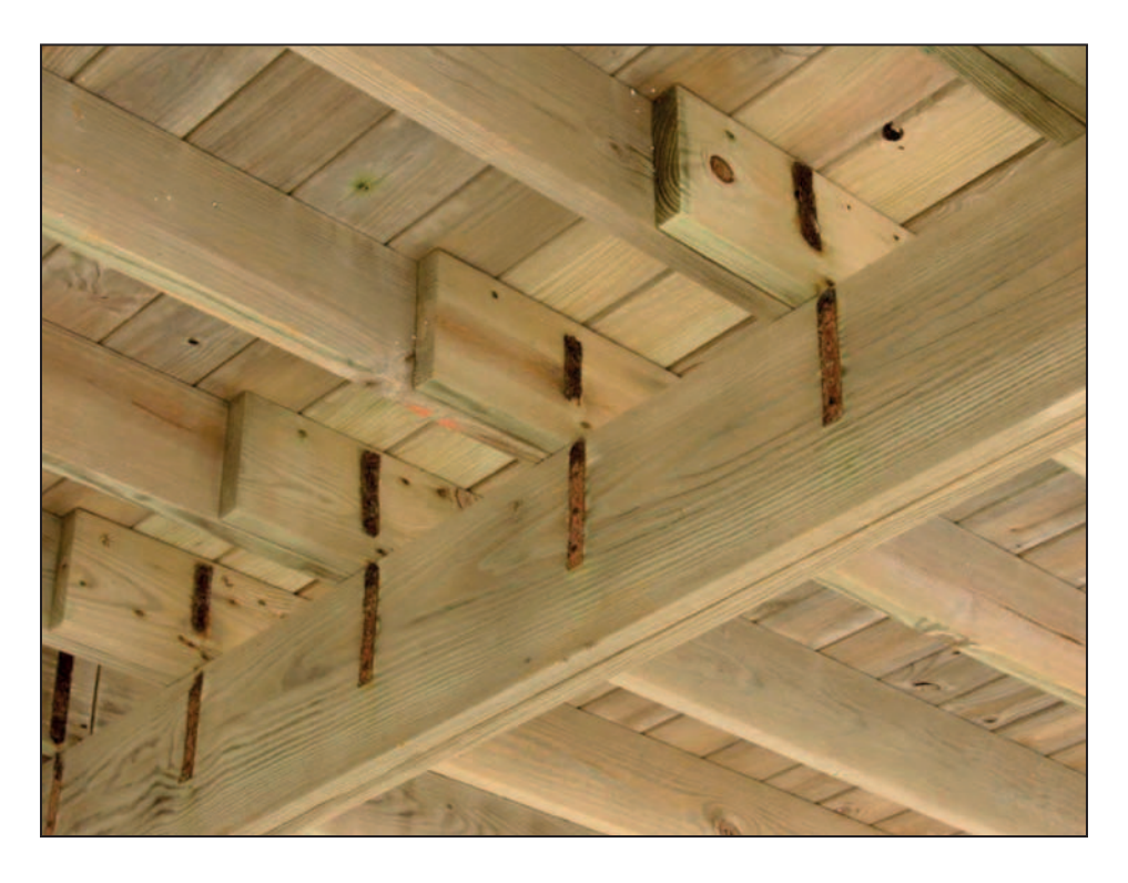
Figure 14-3. Severely corroded deck connectors

Using corrosion-prone sheet metal connectors increases maintenance requirements and potentially compromises structural integrity.