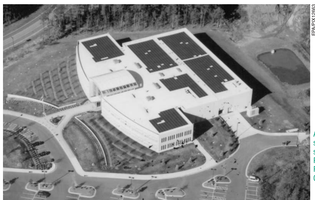
A rooftop photovoltaic (PV) system produces electricity on site at the Environmental Protection Agency's facility in Research Triangle Park, North Carolina.

This guide to on-site power systems is one in a series on best practices for laboratories. It was produced by Laboratories for the 21st Century ("Labs 21"), a joint program of the U.S. Environmental Protection Agency and the U.S. Department of Energy. Geared toward architects, engineers, and facility managers, these guides provide information about technologies and practices that can be used to design, construct, and operate safe, sustainable, high-performance laboratories.