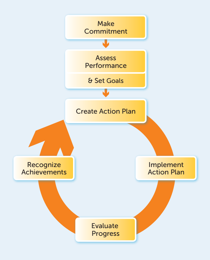
FIGURE 2 OVERVIEW OF ENERGY STAR GUIDELINES FOR ENERGY MANAGEMENT

The ENERGY STAR Guidelines for Energy Management presents a seven-step approach to achieving superior energy management and savings across a portfolio of buildings.