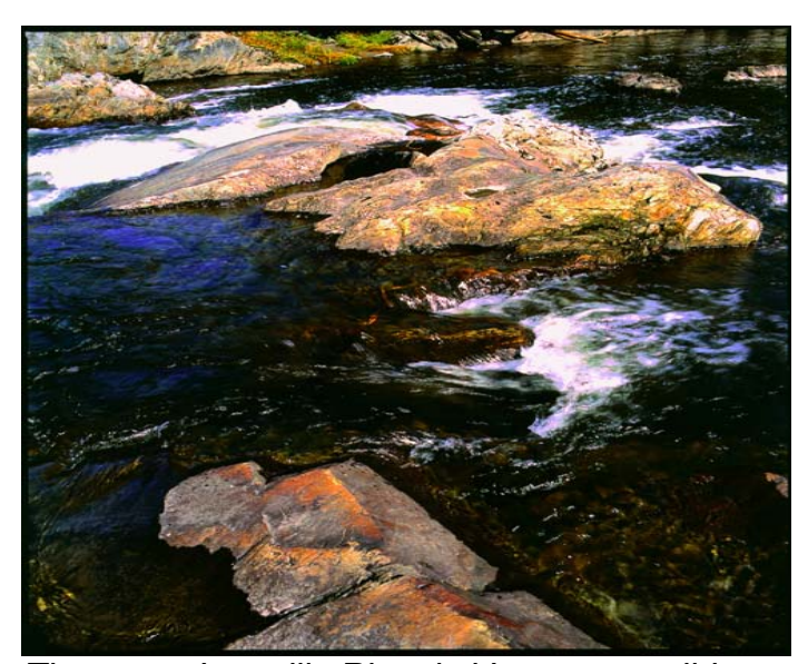
The upper Lamoille River in Vermont, a wild trout fishery.