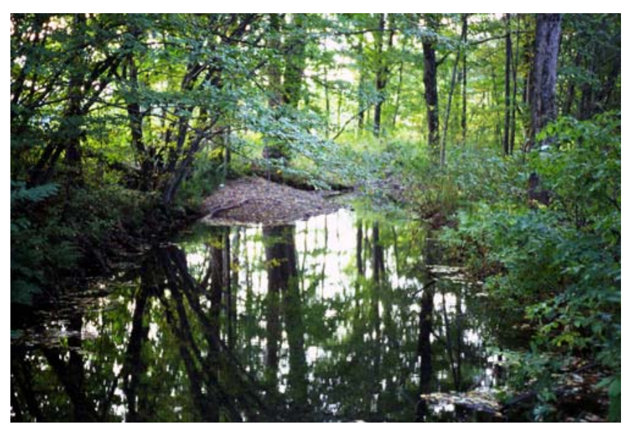
This wetland, in central Massachusetts, floods in late winter and spring, and becomes completely dry by late summer. By August many people viewing this location would never imagine that this site is a wetland.