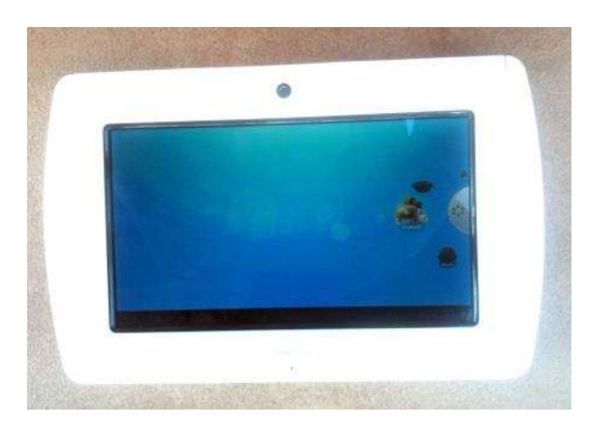
Figure 11. LCD is made up of several dielectric layers.

There is a stereotypical view that metals are good electrical conductors and ceramics are good electrical insulators. However, some ceramics can be excellent electrical conductors and even superconductors – a material that has zero electrical resistance at sufficiently low temperatures. In the late 1980s, a series of ceramic composites were identified as superconductors at temperatures between 90K and 120K. They are the best option for electrical power transport, communications, experimental motors, special antennas, microwave devices and magnetic shielding.