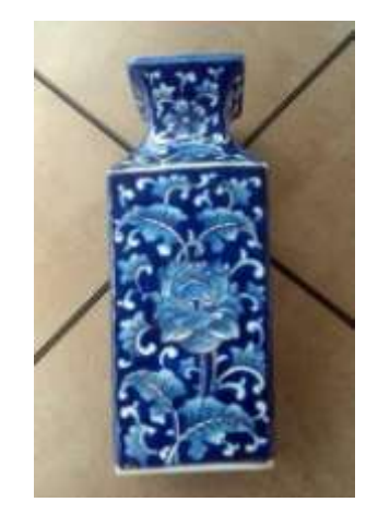
Figure 2. Hand painted glazed ceramic vase.

Since 24,000 BC, humans have been producing earthenware by mixing clay and water, molding it into a shape, and then drying and firing it. The traditional ceramics cover a wide variety of materials and applications including bricks, refractories, cements, plasters, tiles, sanitary sets, dinnerware, etc.