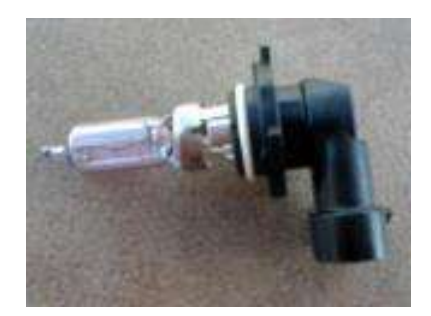
Figure 9. Headlight bulb of a conventional vehicle.

Glasses are essential parts of a vehicle. They have been used for windows, lamplights and mirrors. In order to improve the strength of window panes, a coating of low thermal expansion glass was applied over the high thermal expansion glass. During the cooling process, the high thermal expansion glass layer shrinks more quickly and pulls the low thermal expansion glass layer into a compressive stress state. Therefore, to break the glass by a tensile force, the compressive stress has to be overcome whereas the compressive stress of glasses or ceramics is very high.