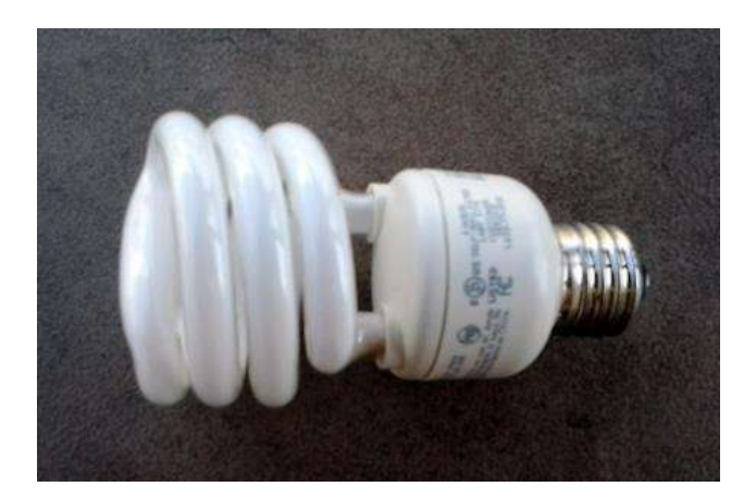
Figure 5. Spiral shaped fluorescent light bulb.

The most common street lights are high-pressure sodium vapor lamps. These are the lights that are mounted on long poles and give off a yellowish hue. They were invented in the 1960s and have been widely used since then due to their efficiency. An incandescent bulb produces only 15 lumens per watt and lasts 1,000 hours, while a high-pressure sodium vapor lamp emits about 10 times more light and lasts almost 25 times longer.