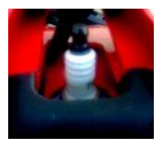
Figure 8. Spark plug insulator of a bush trimmer engine.

A conventional internal combustion engine in a car has approximately 40% thermal efficiency, whereas a turbo compound diesel engine equipped with heat-insulating ceramic components (combustion chamber, exhaust manifold) and additional exhaust-gas energy recovery systems is estimated to achieve a thermal efficiency upwards of 65%.