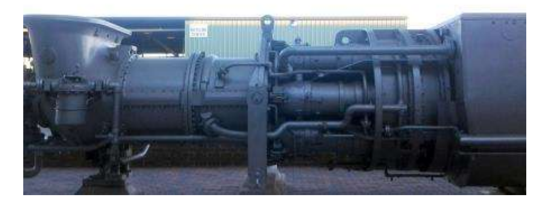
Figure 10. The external view of a gas turbine engine.

In addition to coating, sealing is another important application of ceramics in jet engines. The main rotor bearing seal of a jet engine must seal the oil lubricating system from 800,000 Pascal hot air at temperatures up to 600°C and a surface speed up to 6,000 meters per minute. Recently, a composite of graphite impregnated with other material to increase its strength and oxidation resistance was developed to be used as the seal element for the main rotor as well as other critical gas turbine engine shaft seals.