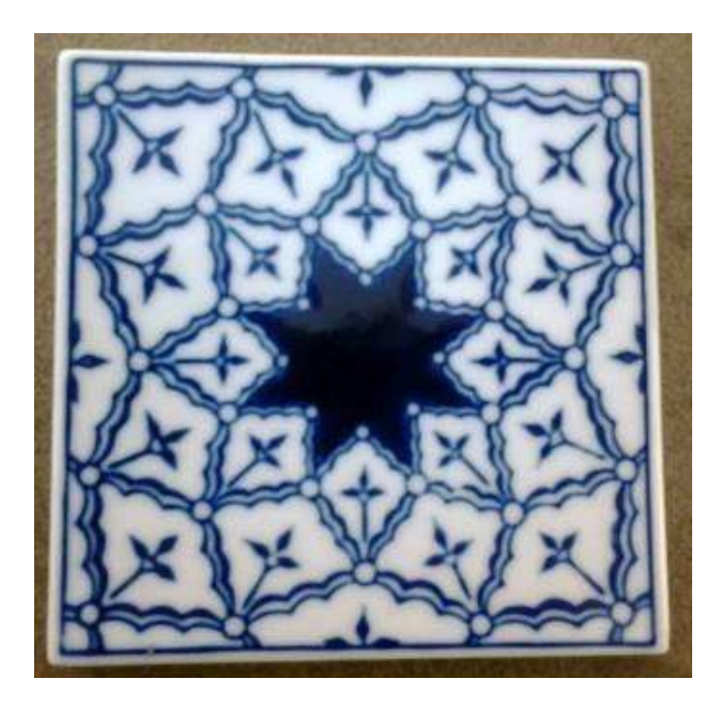
Figure 1. Ancient pattern tile.

The Chinese built the Great Wall of China using fired or air-dried bricks, and centuries later they refined the clay-making process to create fine china porcelain. Egyptians melted a mixture of silica sand, lime and soda to make glasses and to use as coating or glaze in making jewelries and art pieces. About 2,000 years ago, Romans started mass producing of glassware. During the industrial revolution, ceramics were vastly used as molds, insulations and liners for metallurgical furnaces.