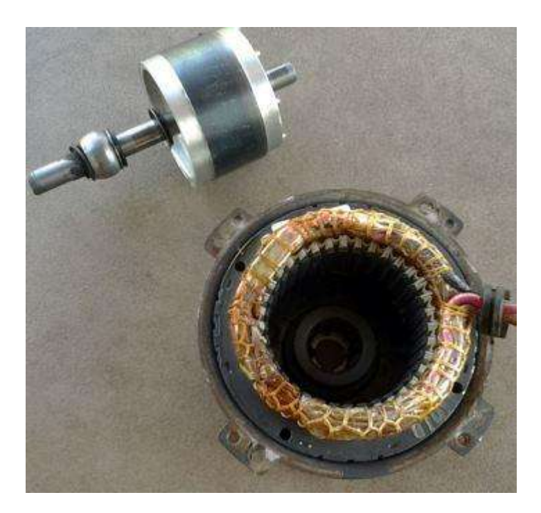
Figure 3. Electrical motor of an AC unite, including magnetic ceramics.

Magnetic ceramics and glasses have recently generated many applications in modern households.