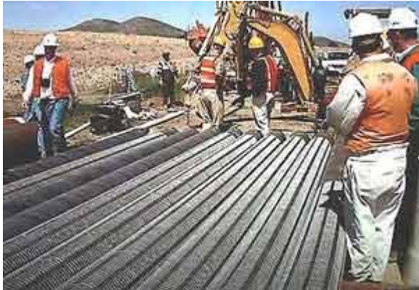
Figure 7: In this example, a supply of slotted, stainless steel screens is delivered to a construction site for use in installation of numerous large dewatering wells. Since these slotted screens will be fitted into pipes obtained from other suppliers, it is critical that they are manufactured according to design specifications and not be bent or damaged during shipment and delivery.