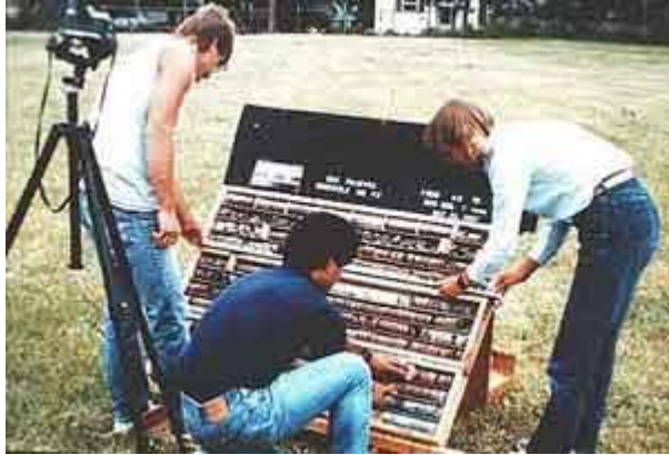
Figure 12: Handling and photographing rock cores placed in protective crates that are properly labeled in preparation for shipping and storage.

of this criterion addresses the need for qualified and trained individuals to manage the handling, cleaning, packaging, shipping, preservation and storage of materials in accordance with written work instructions.