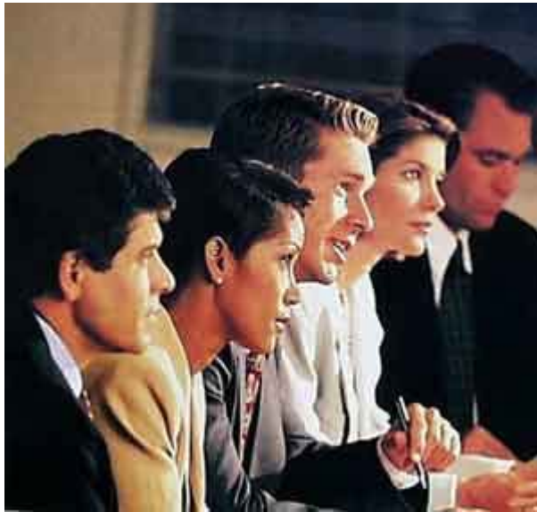
Figure 4: Training is important to familiarize project staff with the QA requirements. Classroom training

is the traditional approach and still the most commonly used. However, with the advent of e-learning, organizations have more options for providing the necessary training and skill building.