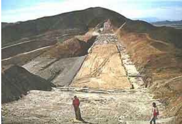
Figure 5: The numerous design-specifications that are issued during the construction of a major dam are reviewed, verified and checked long before bids are let and construction starts.