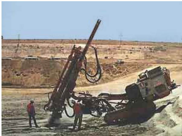
Figure 6: Before hiring a new drilling company, someone with experience should visit potential contractors to inspect the condition, quality and adequacy of their equipment. In the case above, it was discovered too late that the contractor hired could not drill angled borings within the specifications of the work order. Getting a new contractor wasted time and money, and set the project seriously behind schedule. The lowest bidder isn't always the best option. An adequate QA program can prevent such problems.

In addition to this plan, the procurement documents should also identify which records must be maintained by the supplier or contractor and which should be delivered to you before their material or work product is used. You should also require that the supplier or contractor permits you to visit their facilities and access records pertaining to your orders.