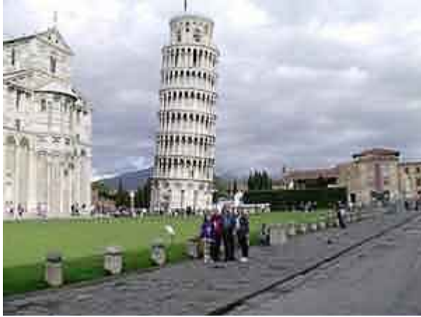
Figure 1: The Tower of Pisa is one famous example of a structure that did not perform satisfactorily in service.