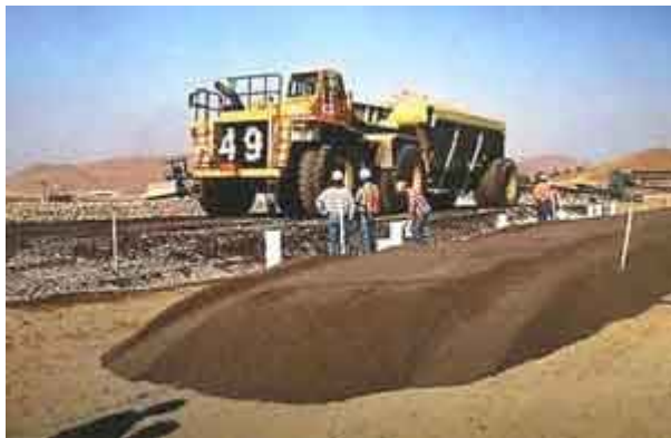
Figure 10: This example shows large scale field testing of a fill sample to verify grading, moisture content and compressibility before using the material in the construction of a dam.