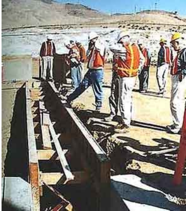
Figure 9: Senior members of an Expert Board of Consultants inspect the construction of a cut-off wall in the foundation of a large dam for conformance with design specifications.