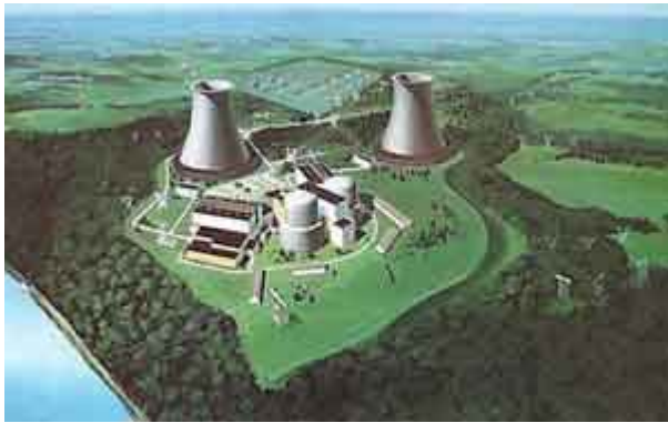
Figure 2: A complex project such as a nuclear power plant is required by federal law to have a comprehensive QA program that addresses all 18 criteria. However, the principles of QA are applicable to and beneficial for all types and sizes of projects dealing with the design and construction of structures, the manufacturing of products and the performance of professional services.

Each of these 18 criteria is addressed below. For each criterion, three questions are answered: “ What does this criterion address? ”, “ Why is this criterion important? ”, and “ How is this criterion implemented? ”