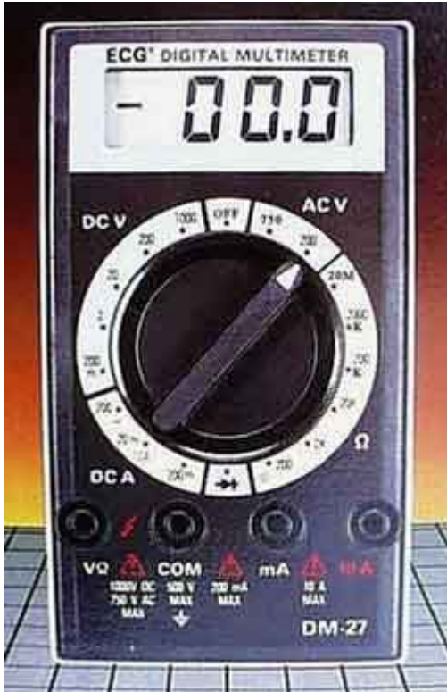
Figure 11: This meter should be calibrated before use and checked periodically to maintain accuracy.