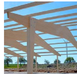
Glued Laminated Timber